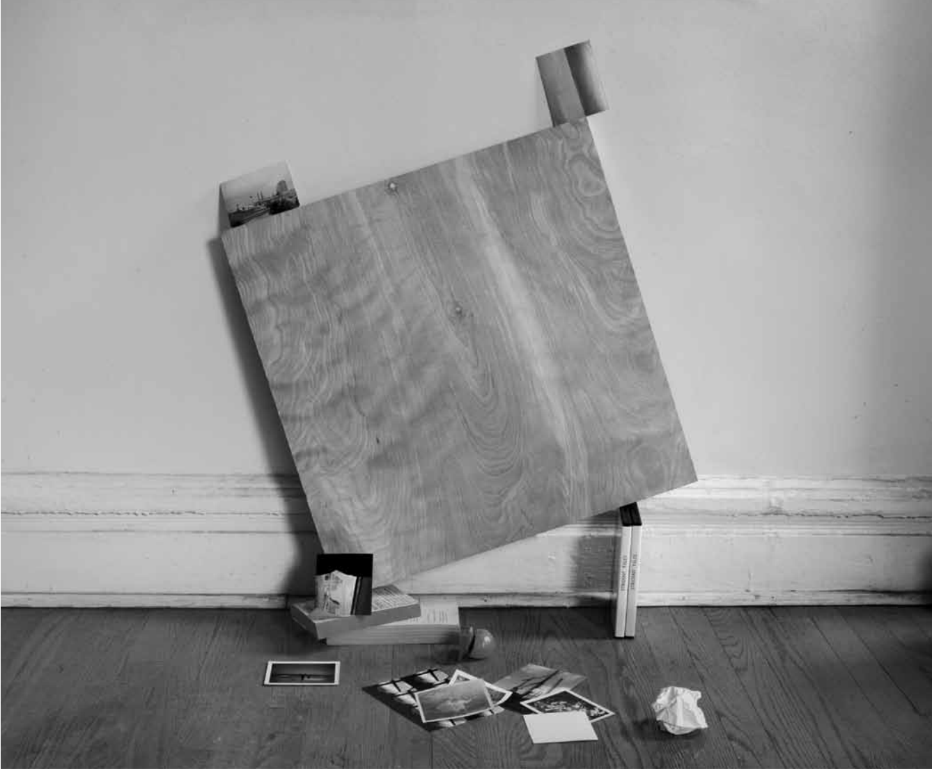
midday / Leslie Hewitt 2009